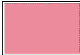
FULL PAGE DIGITAL SLIDER 1920 X 1080 PX