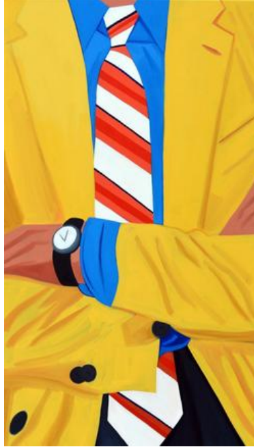
The Yellow Suit