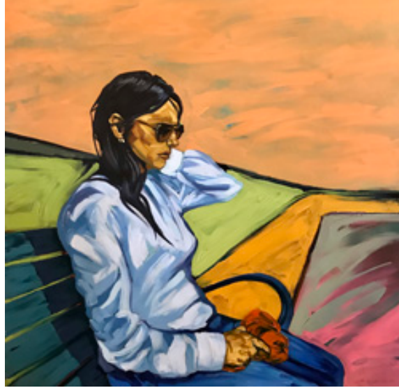
El camino amarillo