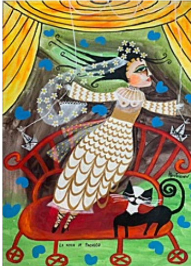
La novia de Pacheco