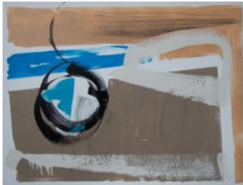
Untitled (Gray & black circle) Mixed media on canvas 2023 40 x 30 in $2,800

The artist establishes a dialogue with the work, sometimes reaching to the deepest parts of himself. To allow the work to surprise him, he never sketches. For him, painting is a necessity of the spirit that lets him see and share the world from his own window.