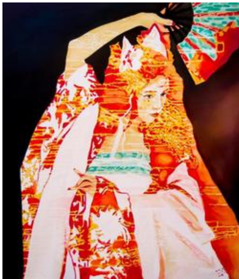
Danza del zorro