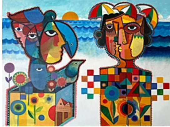
Grupo de amigos a la playa Group of Friends at the beach Acrylic on canvas 2024 35 x 49 in $4,800