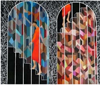
Los Arcos de Belem The Arches of Belem Oil on canvas 2024 30 x 36 in $3,000