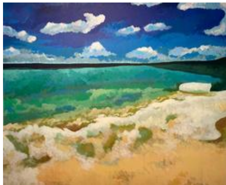
Untitled from the Caribbean Services series Acrylic on canvas 2024 28.5 x 35 in $1,500