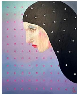
Todas la flores de Abril All of the April Flowers Oil on canvas 2024 29.5 x 39.5 in $2,600