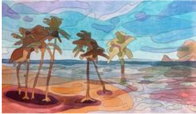
Untitled (7 palms)