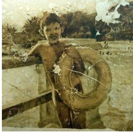
Untitled (boy with float)