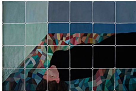
Paseo suspendido Adjourned outing Oil on canvas 2021 39 x 58 in $5,800