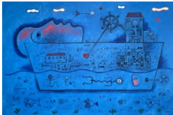
Navegate a ti mismo