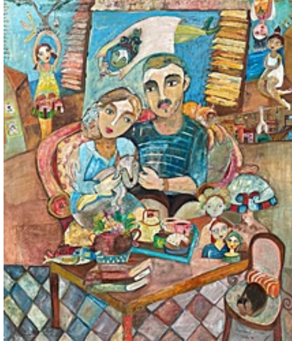
Celebración de la vida