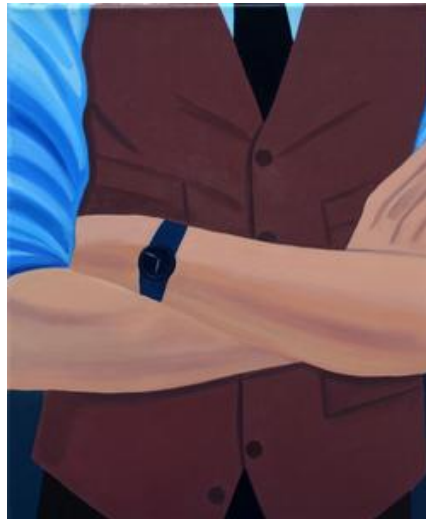
Vest with crossed arms