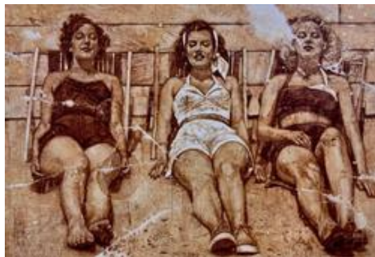
Untitled (Sunning ourselves)