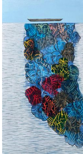
Cruce Peligroso Dangerous Crossing Oil on canvas 2023 15 x 28 in $1,400