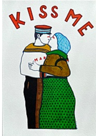
Kiss me (couple)