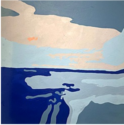
Untitled (abstract seascape) Acrylic on canvas 2023 27 x 27 in $1,100