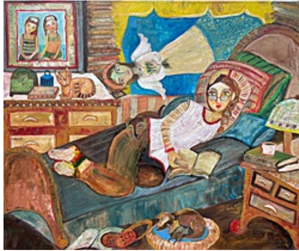
Intimidad Intimacy Oil and oil pastel on canvas 2022 39 x 46 in $3,850