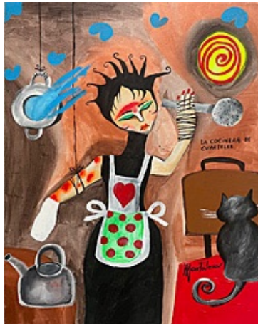
La Cocinera de cuarteles