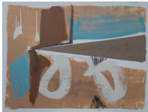
Untitled (beige & turquoise) Mixed media on canvas 2023 40 x 30 in $2,800