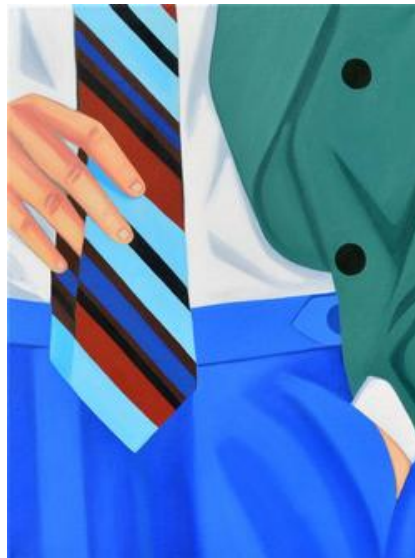
The Manager II