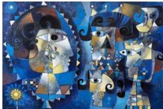
Pretendientes Suitors Acrylic on canvas 2023 24 x 36 in $2,500