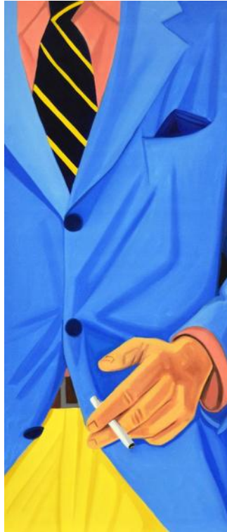
The Cigar Man