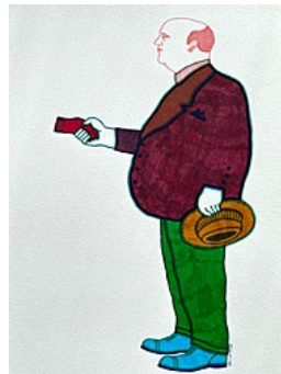
Untitled (Nice to meet you)