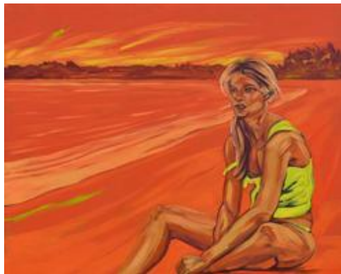
Vivir en la orilla