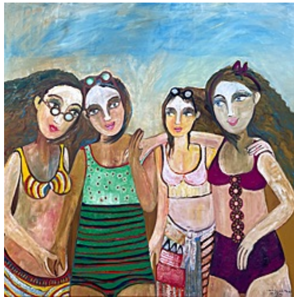
Muchachas en la playa Ladies at the beach Oil and oil pastel on canvas 2023 39 x 39 in $3,500