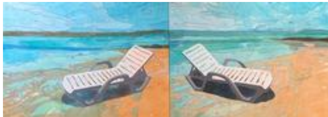
Comfort Minded Mixed media on canvas- diptych 2022 31 x 78 in $2,200